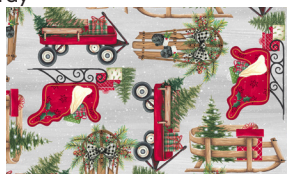
3470-88 Sleds Red