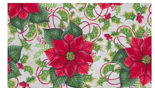
3468-88 Poinsettias Red