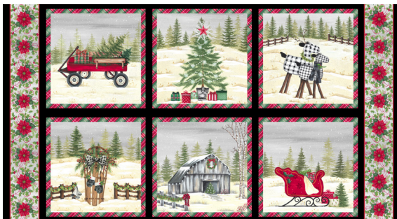
3465-90 Christmas Blocks Gray