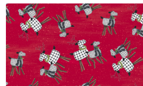
3472-88 Plaid Reindeer Red