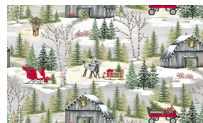
3471-90 Winter Scenic Gray