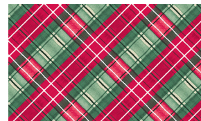
3467-66 Bias Plaid Green