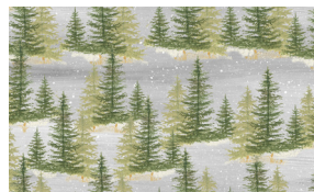
3466-66 Trees Green